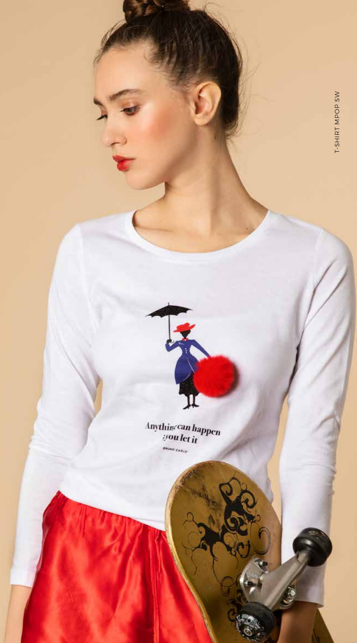
T-SHIRT MPOP SW